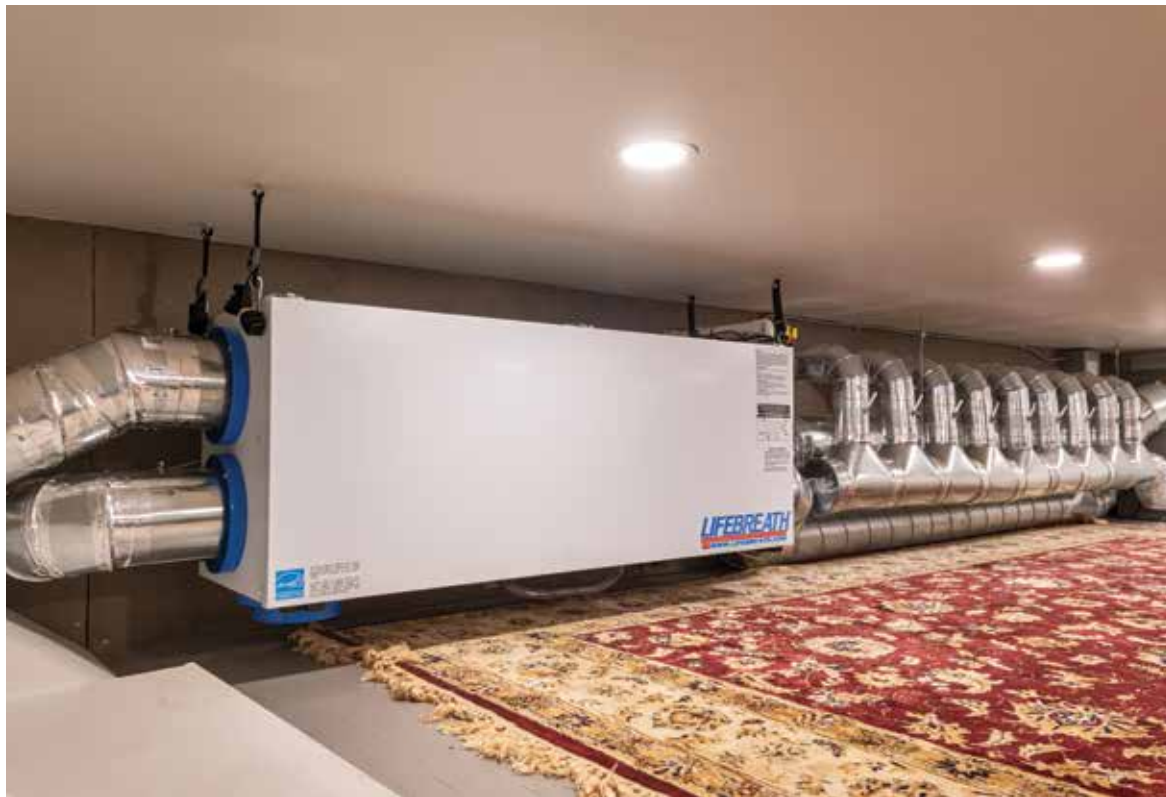
BULKHEAD WAR: An air handler, along with the home's Lifebreath HRV and an AprilAire 800 steam humidifier, was installed in a smaller mechanical space in the attic. Splitting the mechanical components between the basement and the attic was part of the aesthetics war.