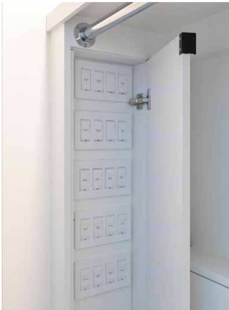
HIDDEN TECHNOLOGY: Gonell Homes – the custom builder on this project – wanted discrete HVAC that was highly visible only in the mechanical area and invisible elsewhere. For example, this recessed panel, once closed, removes any appearance of controls

Every zone features a label that was 3D printed in the Blackrock studio, and each loop has a pair of isolation valves. One wall of the mechanical room features a black box wrapped in carbon fiber and illuminated with LEDs. This was for aesthetic purposes,