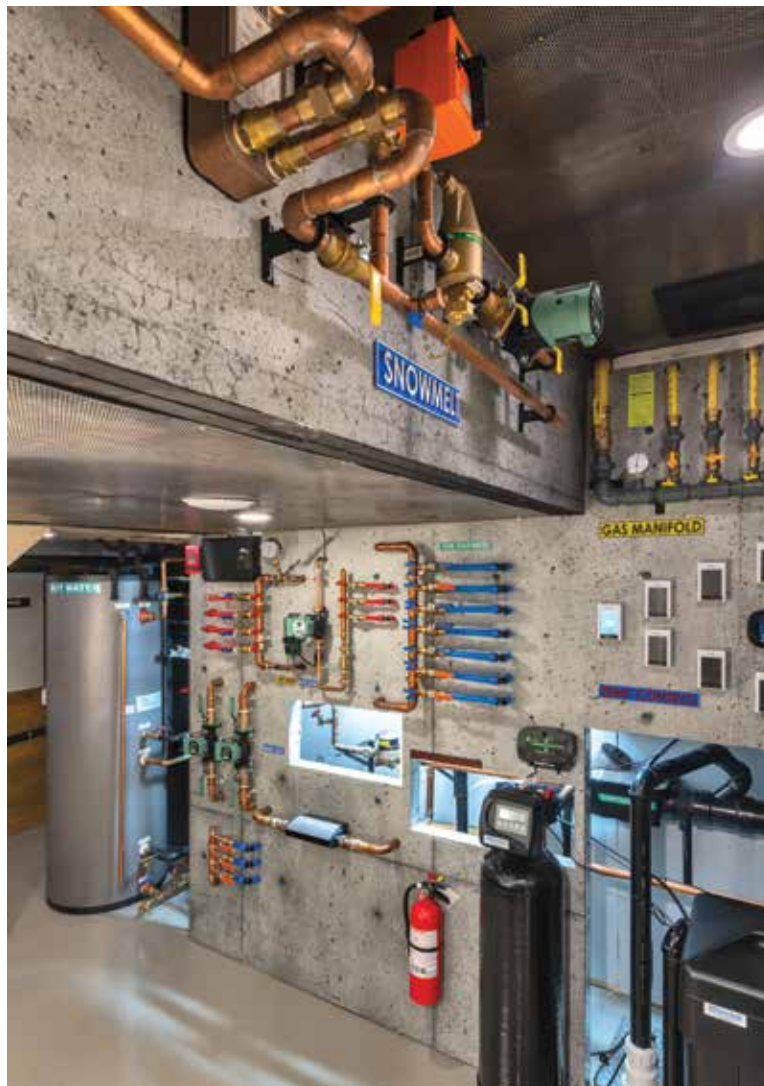
BUNKER APPEARANCE: Blackrock started with plywood walls covered in a very convincingly poured concrete mural, giving the impression that each penetration was neatly core-drilled.

"This job was unique in that it was an old home," said Omeliukh. "I wanted to show off the