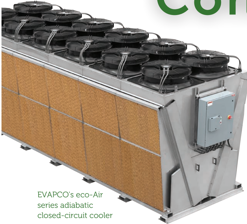
EVAPCO's eco-Air series adiabatic closed-circuit cooler

The average family uses about 300 gallons of water per day. And with 116 million households in the United States, water consumption can quickly add up.