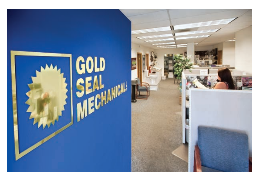
Gold Seal Mechanical celebrates its 50th year of business this year.