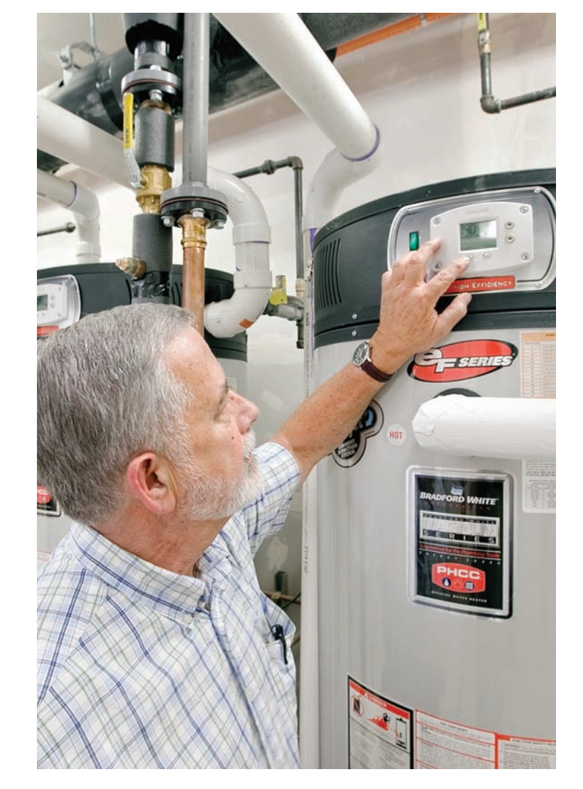
A facility manager sets the function of an eF water heater installed by Gold Seal Mechanical.

Year after year, decade after decade, the clients continue to call on Gold Seal because they've earned the symbol of excellence, and substantiate the chosen name.