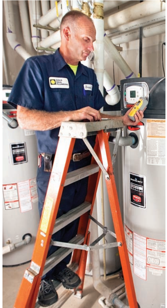
Below: A Gold Seal supervisor performs an annual maintenance check on one of many Bradford White eF water heaters at the Affinity independent living community.