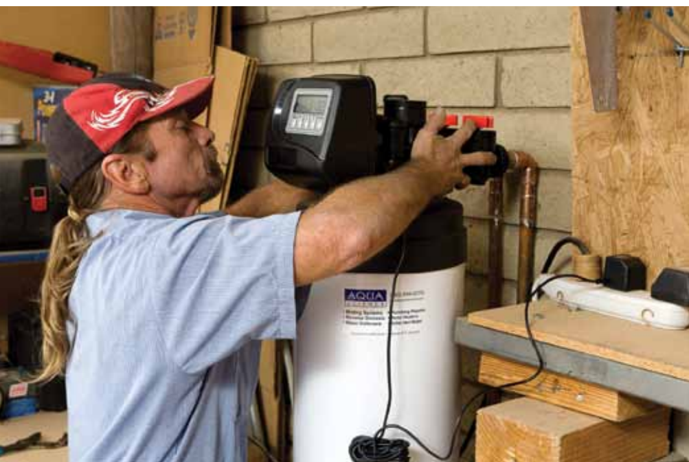
A technician from Phoenix-based Aqua Science installs a Watts Water Technologies water softener in a home.

A look at three tried-and-true methods for water softening & treatment