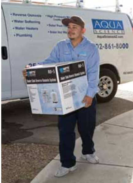
An Aqua Science technician prepares for a residential water treatment installation.

and E. coli , to name but a few, causing a molecular rearrangement of their DNA that renders them unable to self-reproduce inside a home's water supply.