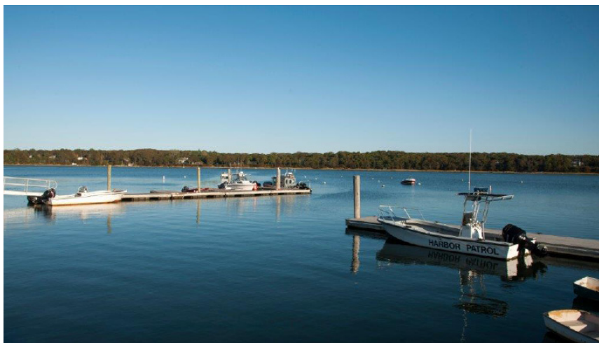
Orleans, Mass., is a fishing town with early French influence dating from 1797.