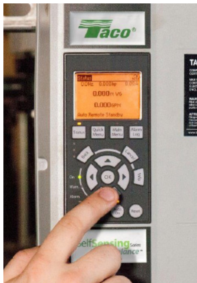
The drives dynamically display flow and power use in real time.

to changes in system demand without the need for pressure sensors. If a classroom zone valve closes, the pumps sense the change and ramp down according to the lower demand. Immediately, the pressure gauge on the supply side starts to drop.