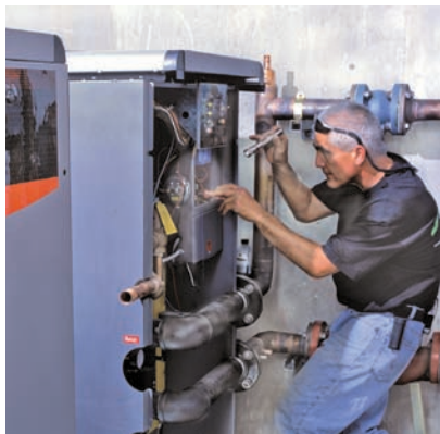
A technician commissions boiler systems at a ski resort in California. The boilers shown are non-condensing, but the system's lead boiler is a condensing unit to handle the very cold return water.

tion happening at the highest levels of combustion efficiency—at all levels of heat demand.