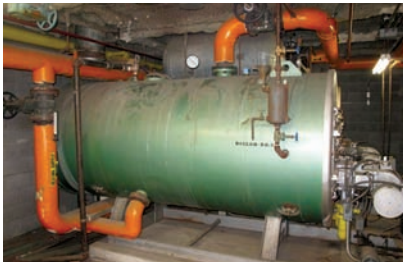
One of two 30-year-old cast-iron boilers removed from the Lutheran Home of Concord Reserve in Westlake, OH.

30-plus-year-old cast-iron boilers. We repiped the mechanical room and replaced the old boilers with three much smaller systems." These systems were one 850-MBH boiler and two 1,000-MBH boilers, both rated at 85 percent AFUE.