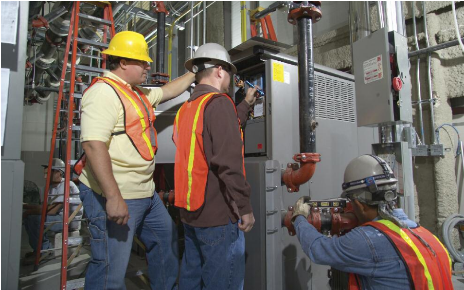
Imcor professionals complete installation of 10 large, high efficiency mod-con Rheos+ boilers made by Laars Heating Systems Co., a subsidiary of Bradford White Corporation.

On April 10, 1874, President Grant issued a patent for the present site of Phoenix, AZ. Total cost of the 320-acre town site was set at $550. Downtown lots were selling for $7 to $11 each. A year later, there were 16 saloons, four dance halls and two banks.